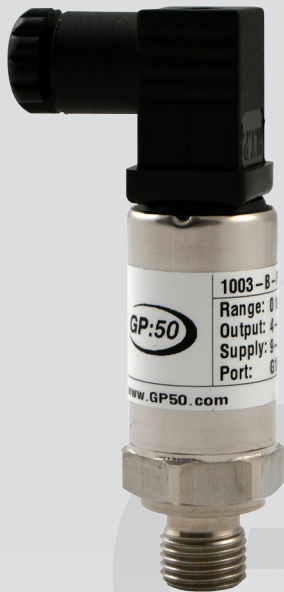
1002 / 1003 Low-Cost OEM Pressure Transducer