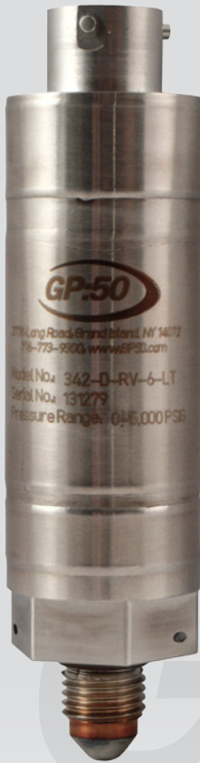
Model 142 / 242 / 342 Vehicle Test Pressure Transducer / Transmitter