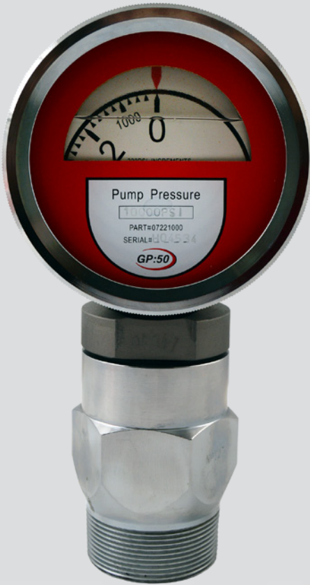
GPMG Series Mud Gauge Diaphragm Type