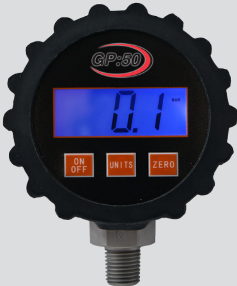
DG-11 Digital Pressure Gauge